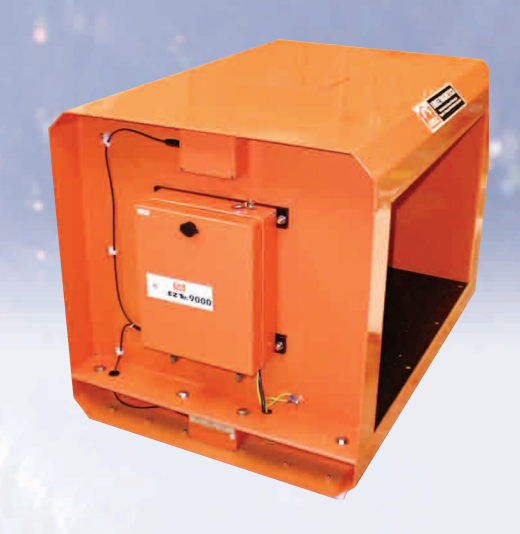
E-Z Tec 9000 RD

The E-Z Tec 9000 RD Divisible Metal Detector has an innovative design which allows the unit to be separated into two parts. This enables a simple installation on existing conveyors without the need for cutting the conveyor belt. Its rugged design allows it to be installed in a range of environments for checking a variety of products, whilst maintaining a high level of sensitivity.