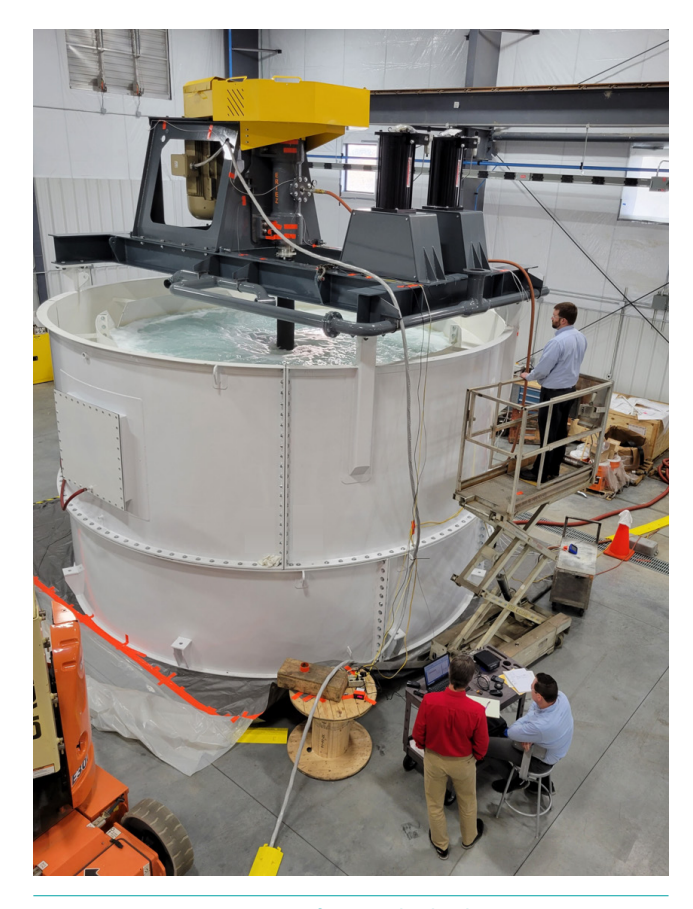
Figure 5. Eriez engineers performing hydrodynamic tests on a StackCell SC200.

This trade-off exists because of the inherent conflict between achieving successful bubble-particle contacting and bubble-particle flotation in the same cell. To avoid the trade-off, Eriez developed a two-stage mechanical cell called the StackCell® approximately 15 years ago (Figure 4). The StackCell uses two compartments: a tank within a tank. The tanks are connected in series, and isolated from one another, except where the exit from the first tank [3] feeds the second [4], and they are operated in such a way that fluid cannot move back into the first tank after it has entered the second one. As illustrated, feed is delivered through a duct [1] into the first tank, also referred to as a 'cannister'[3], consisting of a rotor-stator configuration, which mixes the feed slurry and air with extreme energy. The specific energy inside the cannister is more than 100-times higher than the average specific energy in a conventional cell, so bubble-particle contacting is optimised. The feed travels from the bottom to the top, with a residence time distribution that is designed to approximate a plug-flow in a highly turbulent mixing environment with short residence time, on the order of several seconds. This high energy input does not cause drop-back of coarser particles because bubble-particle flotation only happens in the second tank.