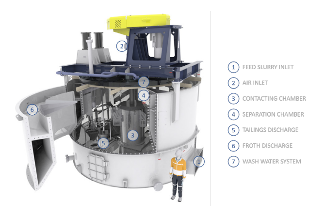
Figure 4. Cutaway of the 2-stage Eriez StackCell®.

starting around 1900 (Figure 2). Curves for the other industrially significant base metals show comparable trajectories emanating from this starting point around 1900. With the advent of froth flotation, copper became a metal that could be used for modernising towns and cities around the world by way of electric motors and generators, transmission systems, telephones, piping and heat exchangers, among other familiar modern devices. We are all beneficiaries of this technological revolution.